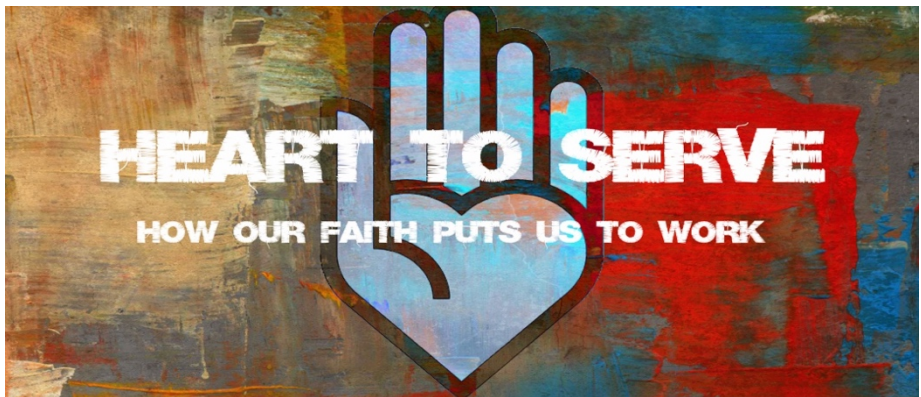
The Least of These | April 25, 2018 Matthew 25:36-40

June 18-22 | $250 Registration and $50 deposit due Sunday, May 6<sup>th</sup>. Register online at exit137.org/studentministry!